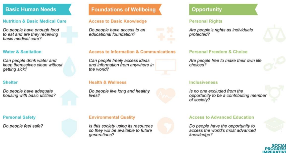
Figure 2: Social Progress Index Guiding Questions